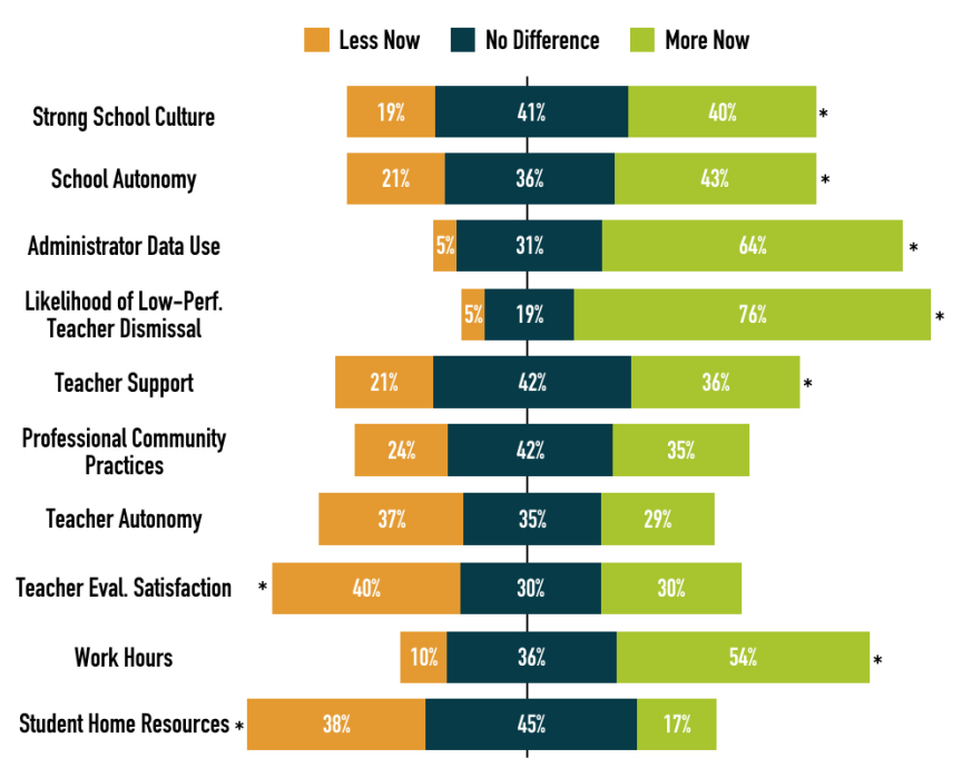
Figure 3. Survey Responses on Work Environment

Teachers' perceptions of changes in the work environment were mixed. Of the ten measured dimensions, teachers reported only two clearly positive changes: an increase in teacher support and a stronger school culture (measured by reported academic rigor, consistent management of student behavior, and a clear vision from the school leader).